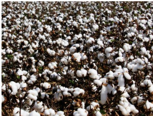
A field of cotton