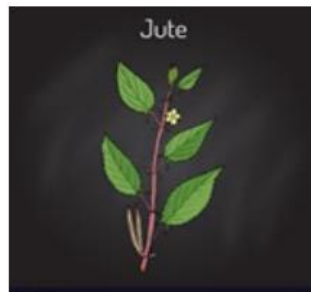
A jute plant